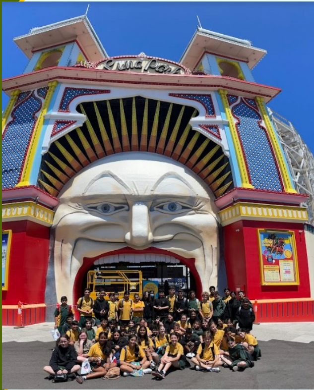
Year 5/6 Excursion to Luna Park