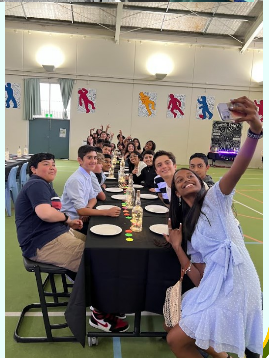
Year 6 Graduation